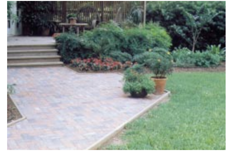
Practical turf areas are neither too large (turfgrass requires more water than other plants) nor difficult to water efficiently.