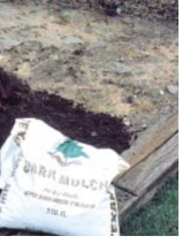
mine whether the soil that it will absorb and