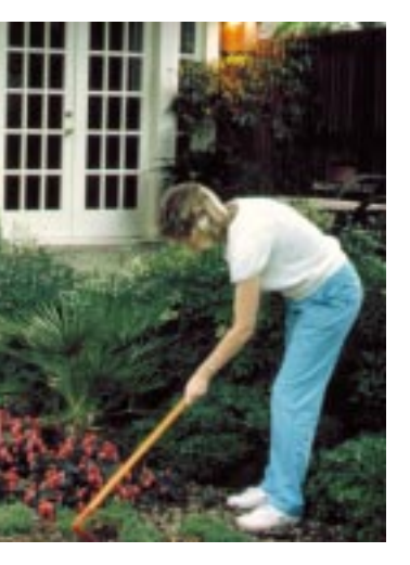
e preserves the landscape's water. Prune, weed, fertill pests properly.