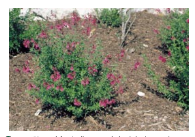
Use mulches in flower and shrub beds to reduce water evaporation from the soil.